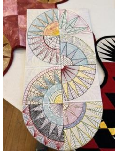
Thread painted Beauties

Thank you for your ideas, enthusiasm, and support. You help make our workshops the fun, creative, community-filled days we all enjoy. We've already begun planning new workshops, and we can't wait to welcome everyone back in September. Wishing you a wonderful summer of finishing projects... or happily beginning fresh ones.