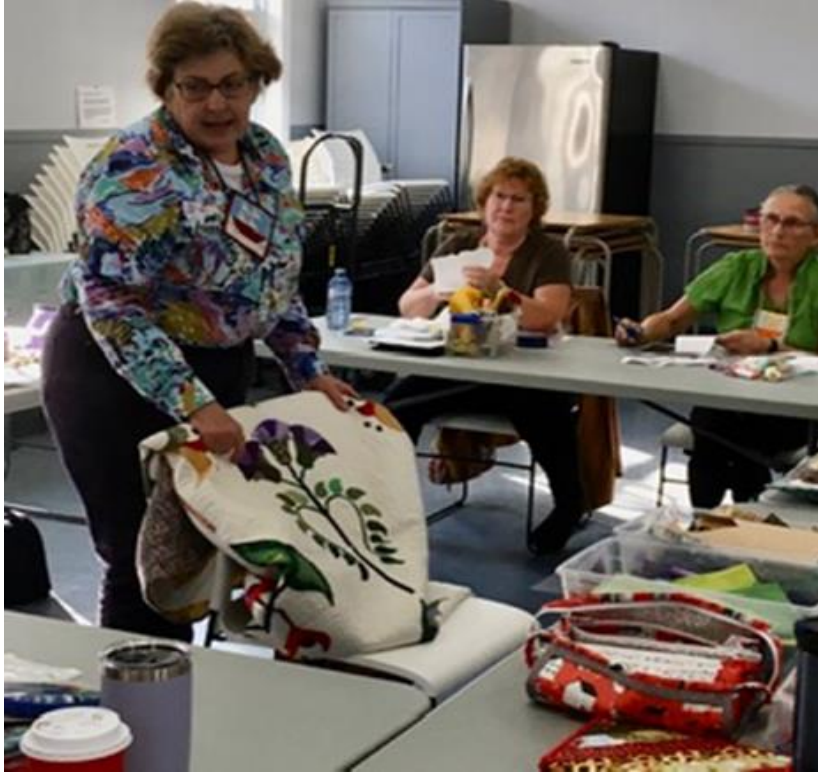
Krista's Turned Edge Glued Apple