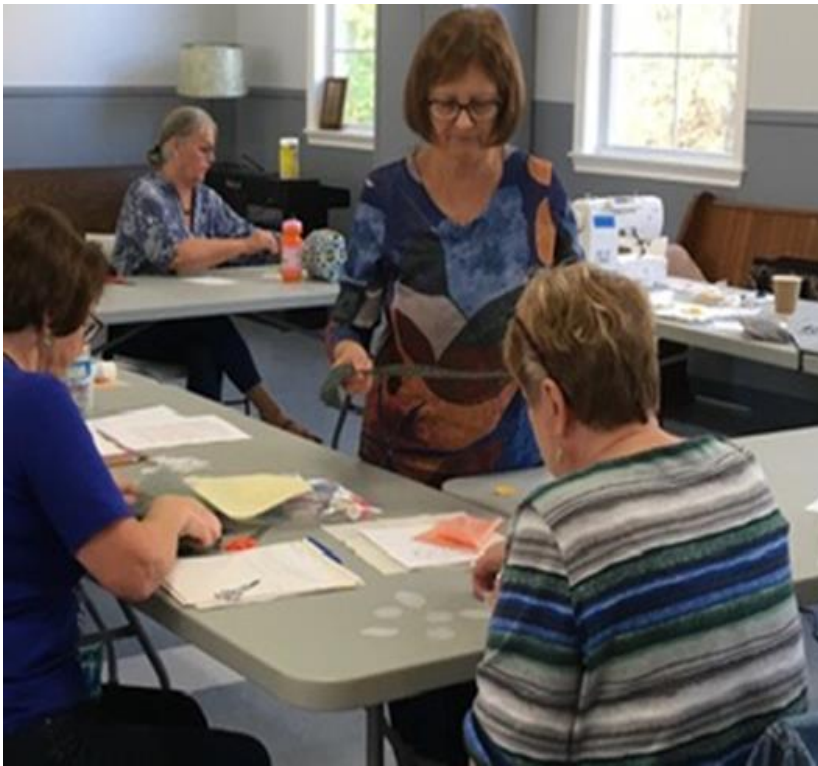
Sandy's Faced Flower