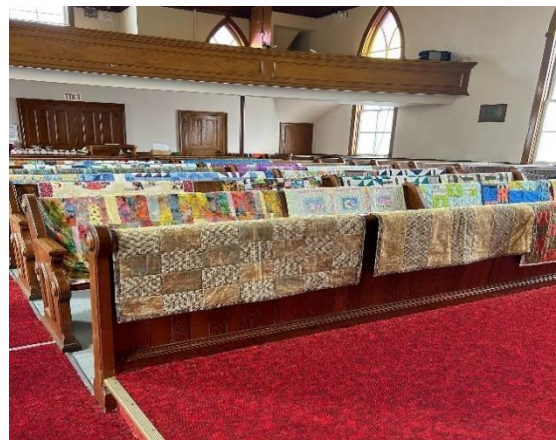
Some of the quilts on display.