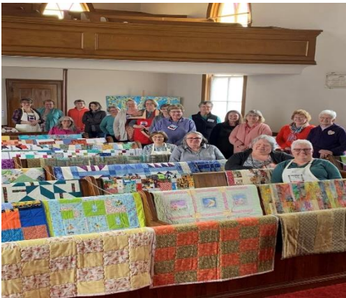
Some of the volunteers