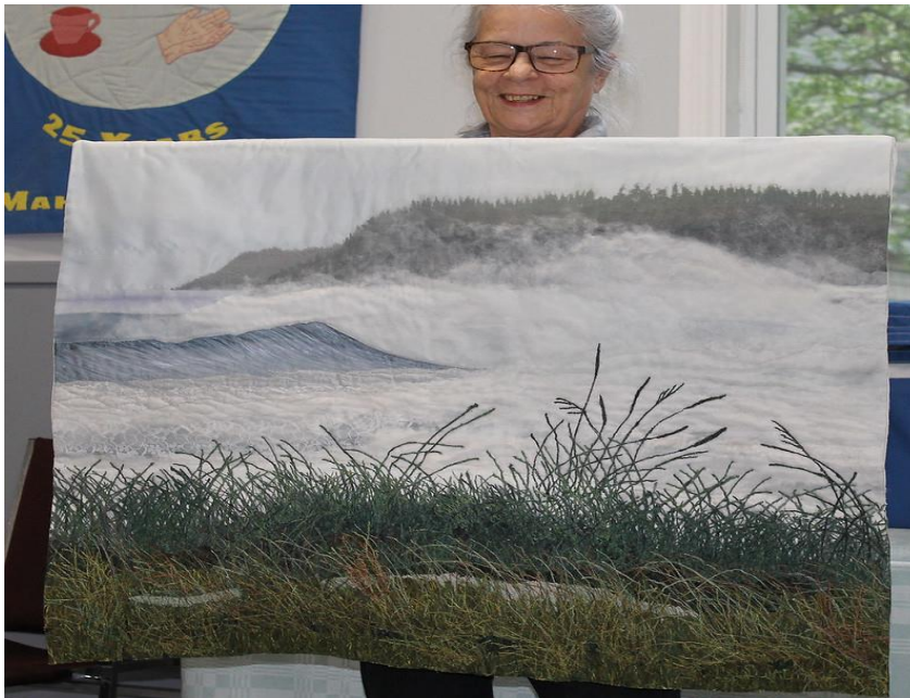
Laurie Swim's Landscape