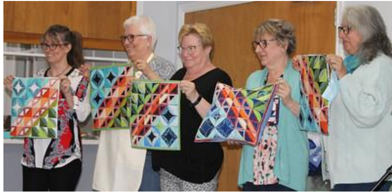
Finished pieces from Peter Byrne's Workshop