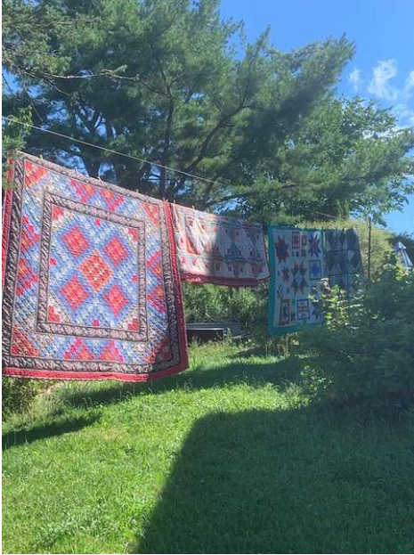
One of Heather Sanff's displays

The weather did not cooperate this year for Outdoor Quilt Day but here are a few pictures from members who managed to display a few quilts outside. Thanks to those who participated.