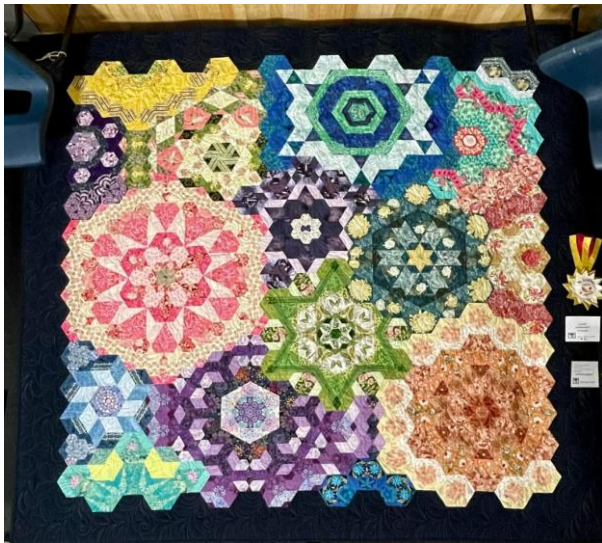
Honourable Mention Best in Show