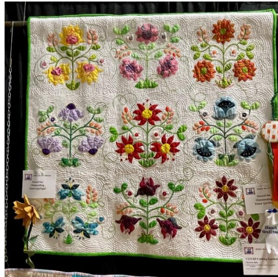
Honourable Mention Best in Show