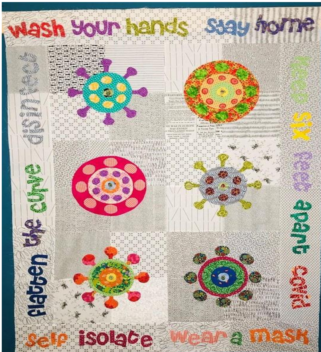
"Memories of Spring, Summer and fall" - Sandra R. A coronavirus quilt top ready to be machine quilted. Blocks are hand applied using Becky Goldsmith's virus patterns. The letters are fused with Steam a Seam