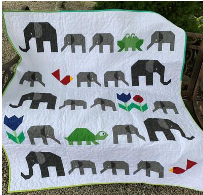
Eldora's Elephant Parade