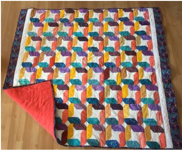
Betty Learning's Quilt

Here are a few pictures from last month: