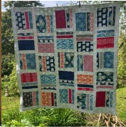
Nina's First Quilt