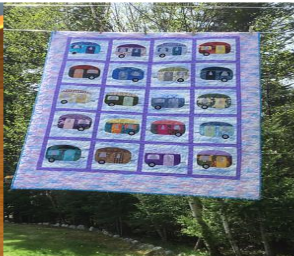
Katina's "Glamping" Quilt