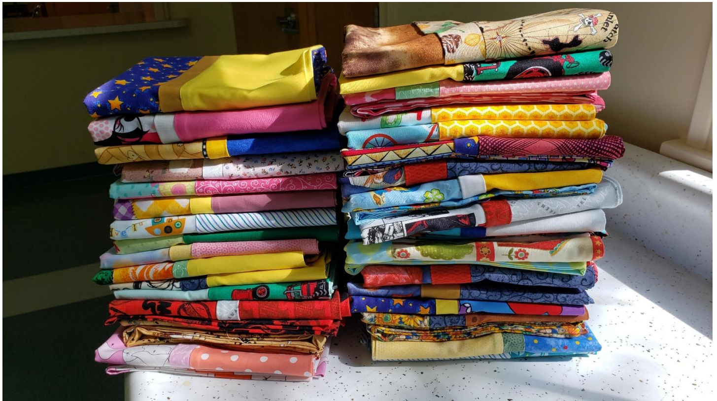
The finished pile