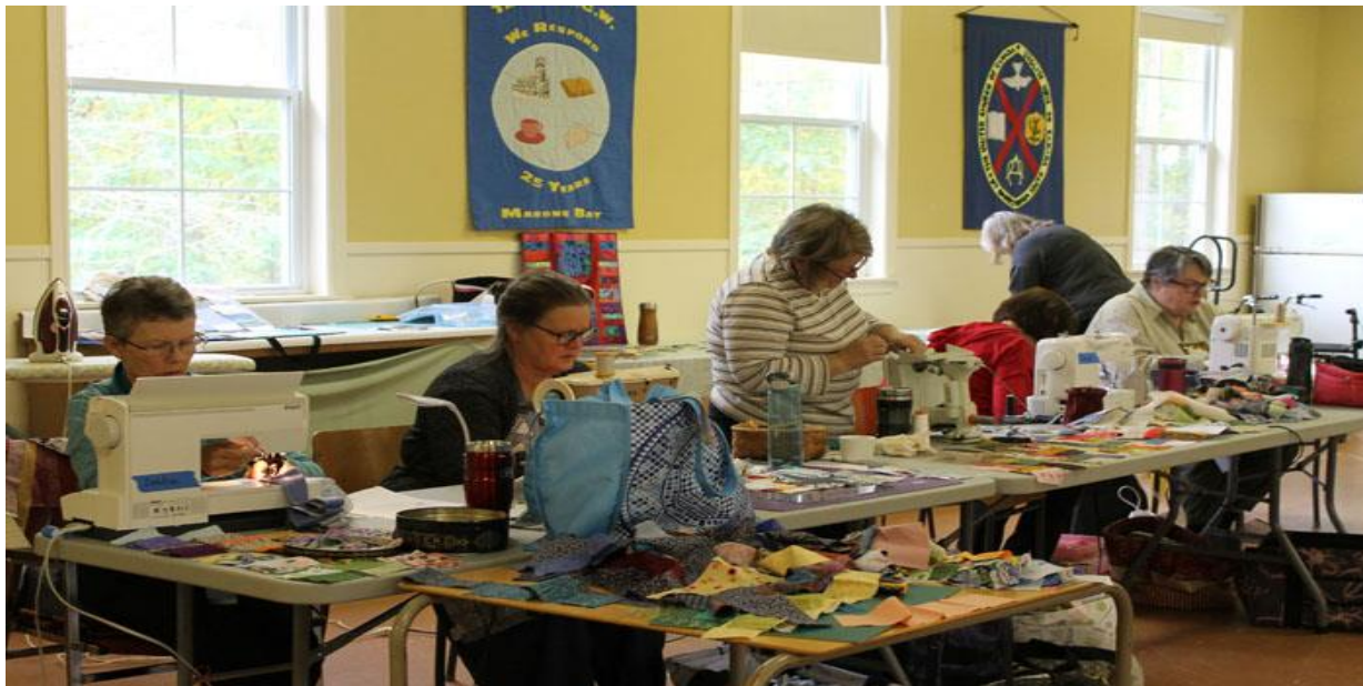
Lots of fabric in play, I hope to see a finished piece at Sew and Tell