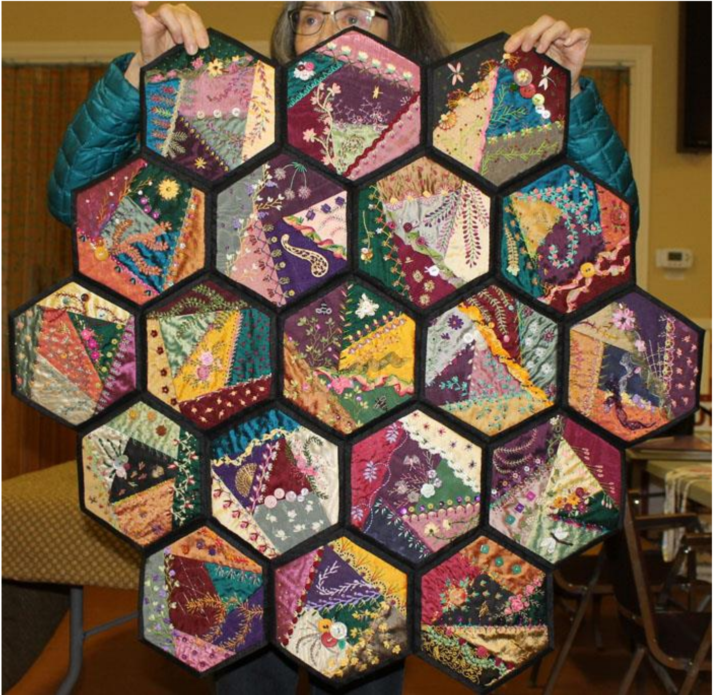
Linda Naugler's Hexagon Quilt

(This section will feature a picture from Sew & Tell)