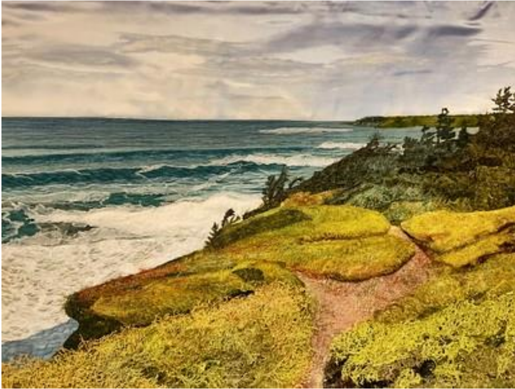
Laurie Swim's Gaff Point