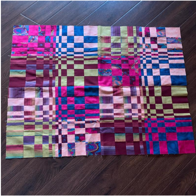
Annette's "Bending the Rules" Finished size will be 30" square