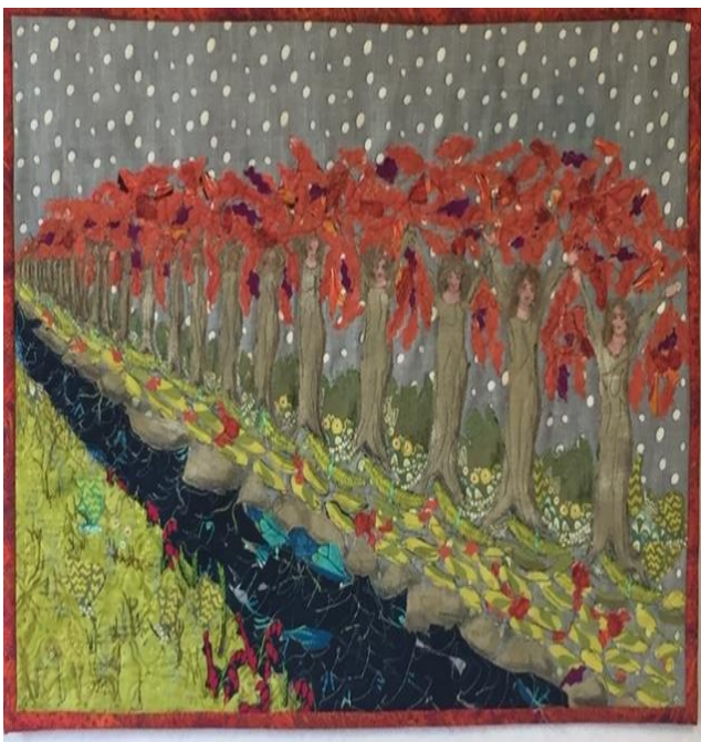
Cathy Drummond's Piece 11x18 inches