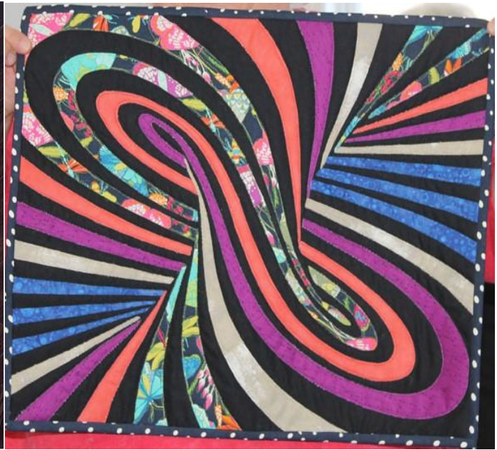
Tara Lynas piece "Vortex" - 11 x 17 inches