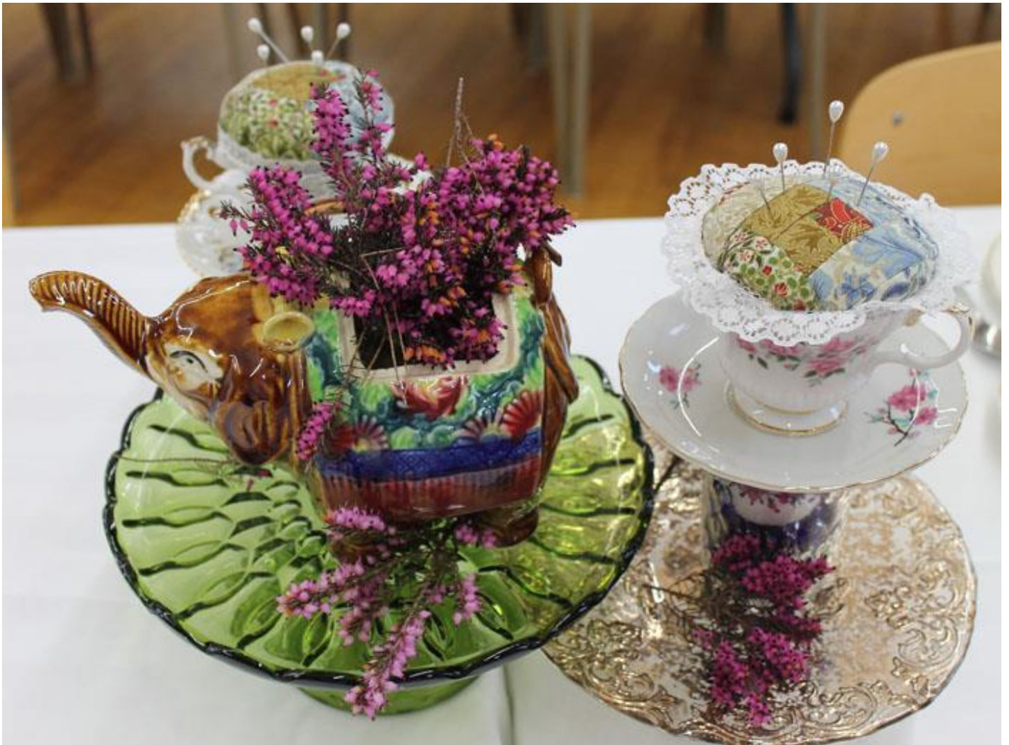
The gorgeous table settings