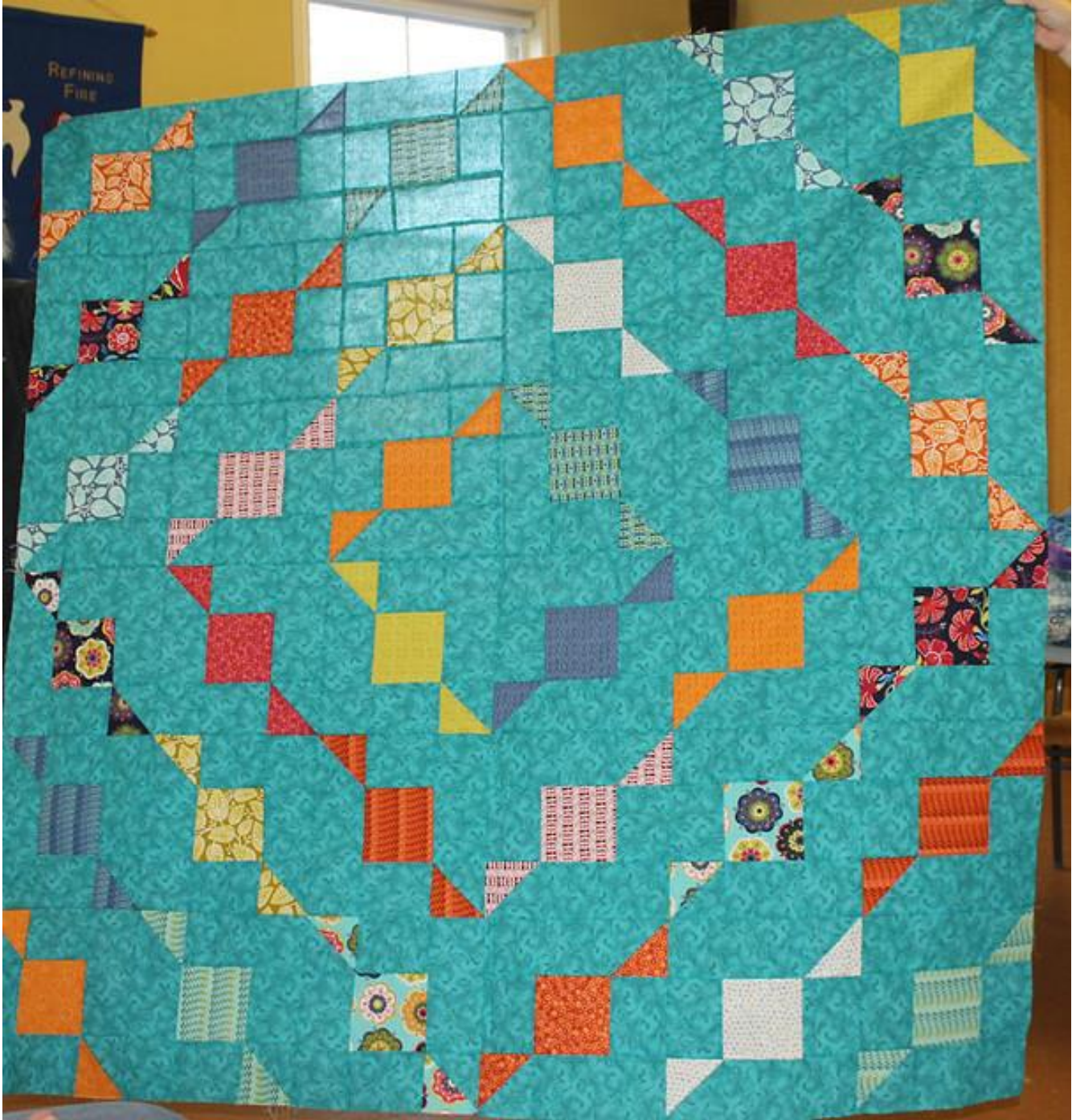
Peggy's Quilt top

(This section will feature picture(s) from Sew & Tell)