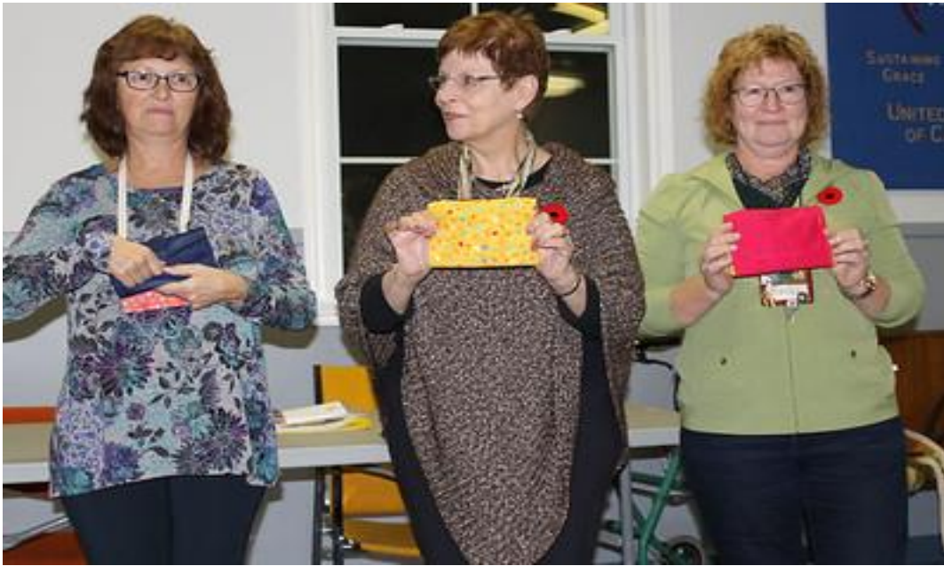
Bridgewater Bee with their project that turns into a bag