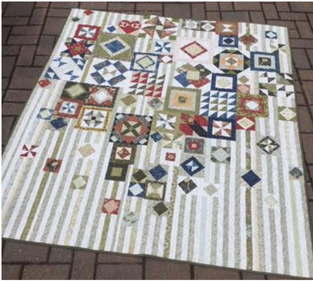
Colleen's Wanderer's Wife

Here are a few pictures from last Month: