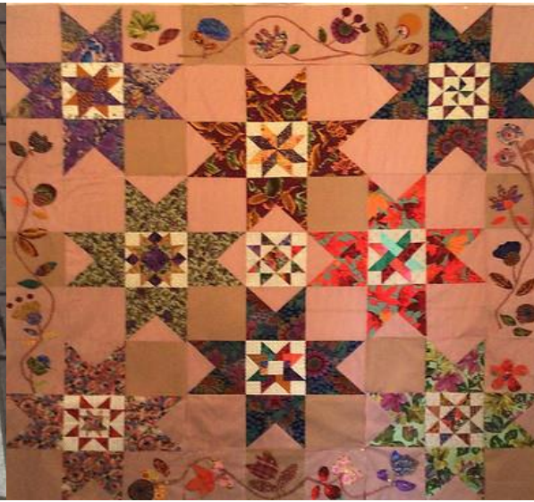
Sandy R's Star Quilt from the Be a Star QAL