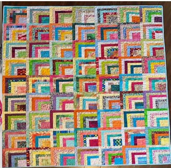
Clarissa's Quarter Log Cabin