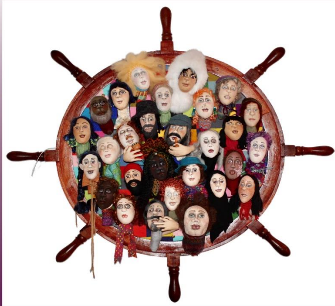
Linda Finley, 36 Million Stories: The Fabric of US , small patchwork quilt

Exhibition location: 103 Bloomfield Centre