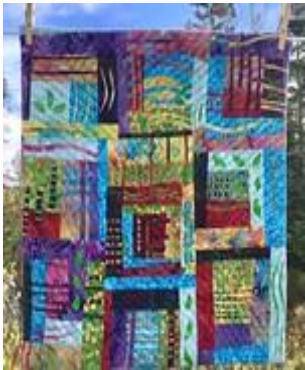
Debbie B's "Fantastic Fusion"

Here are a few pictures from last month: