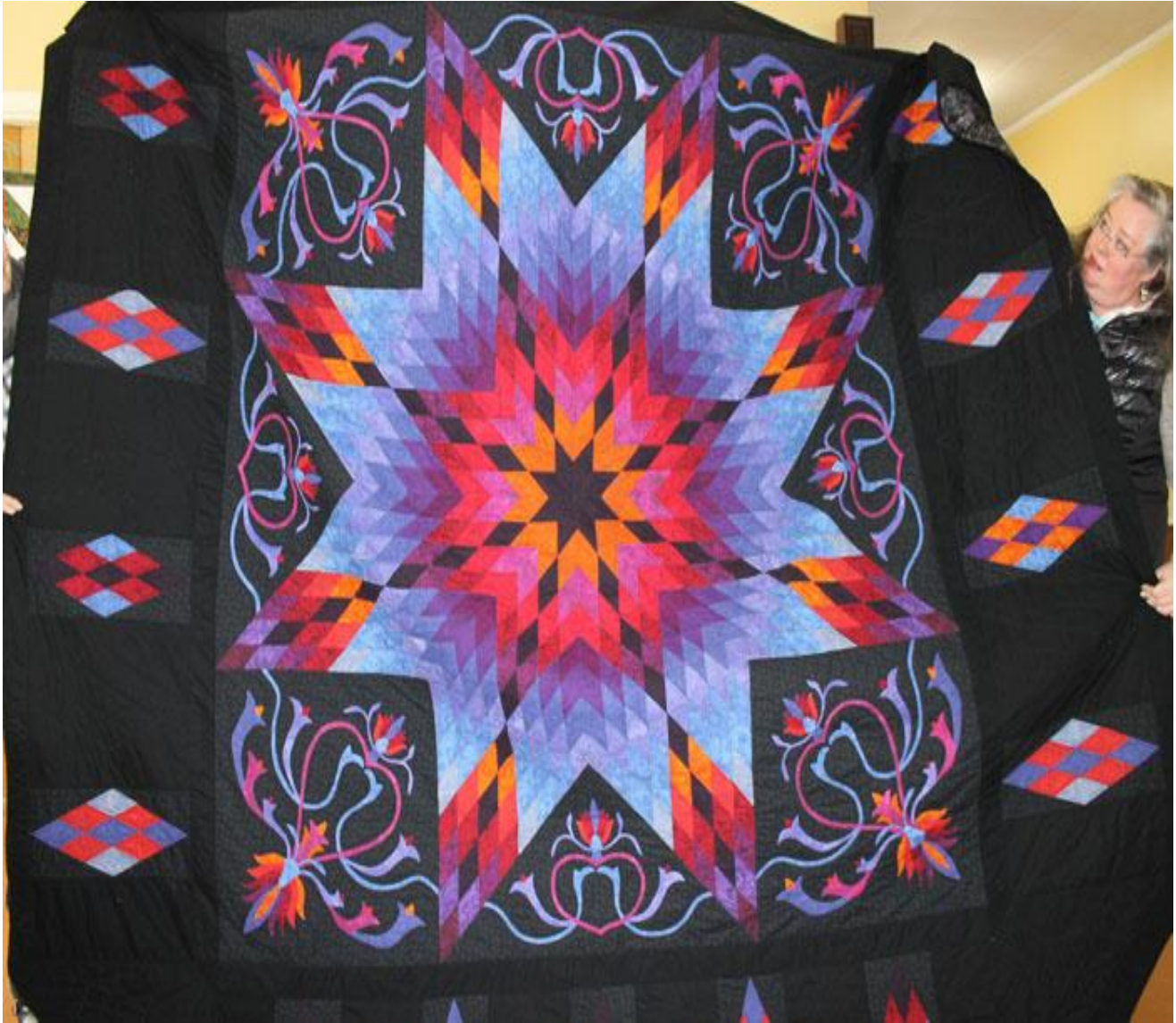
Jan's Lotus Quilt.

(This section will feature picture(s) from Sew & Tell)