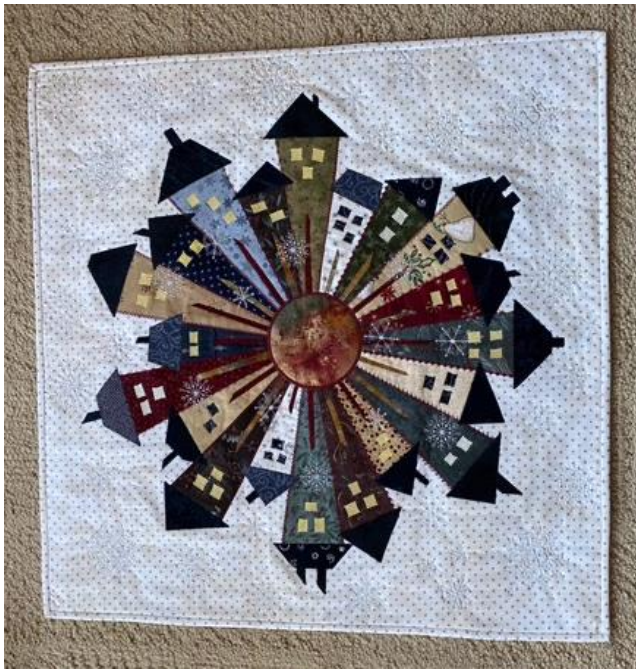
Vicki Burke's beautiful neighbourhood

The Dresden Workshop was a lot of fun. It was amazing to see all the different neighbourhoods being created. There will be a few at Sew and Tell in the near future, I'm sure. Here are a few pictures: