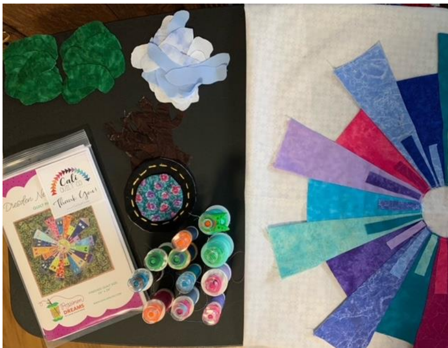
Elizabeth Tumblin's Neighbourhood in production