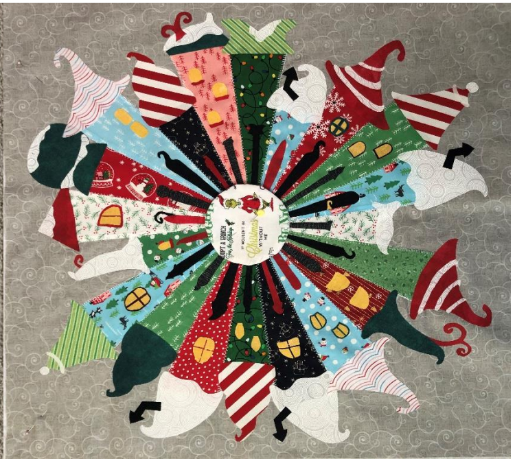
Alicia's creative neighbourhood under construction