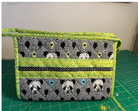
A zippered bag (ByAnnie pattern)