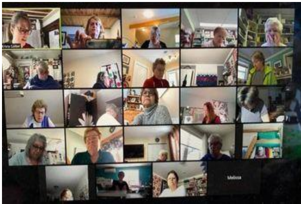
Some of the attendees

We had a fantastic day with helpful demonstrations, lots of laughs, stories shared and wonderful prizes. The day was well organized and over 30 members attended. Many of the members also finished a UFO or two. We may do it again. Here are a few pictures from the event: