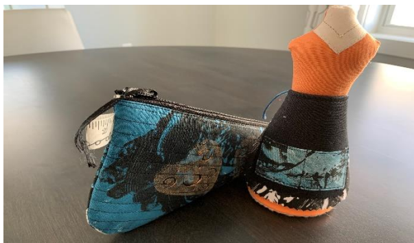
Scissor Pouch and Dress Form Pin Cushion