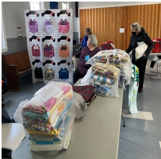
18 quilt donations and Eldora's kimono quilt top