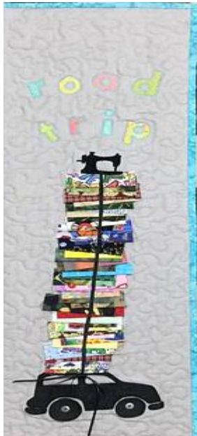
Katina's Road Trip

Unless you specify otherwise, participation in Sew & Tell grants permission to the Guild to include your quilt in our social media posts. Here are a few pictures from last month: